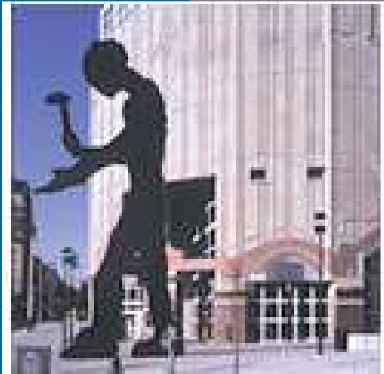
Seattle Art Museum